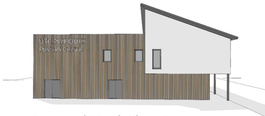
Proposed North Elevation

The new building would be a mix of timber cladding and render, to reflect the immediate context of its proposed location.