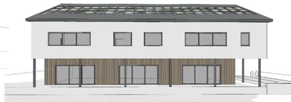
Proposed West Elevation