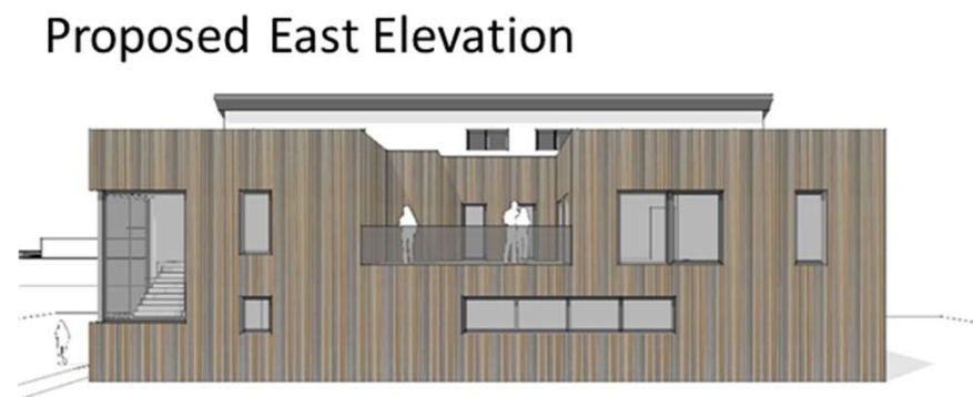
Proposed East Elevation