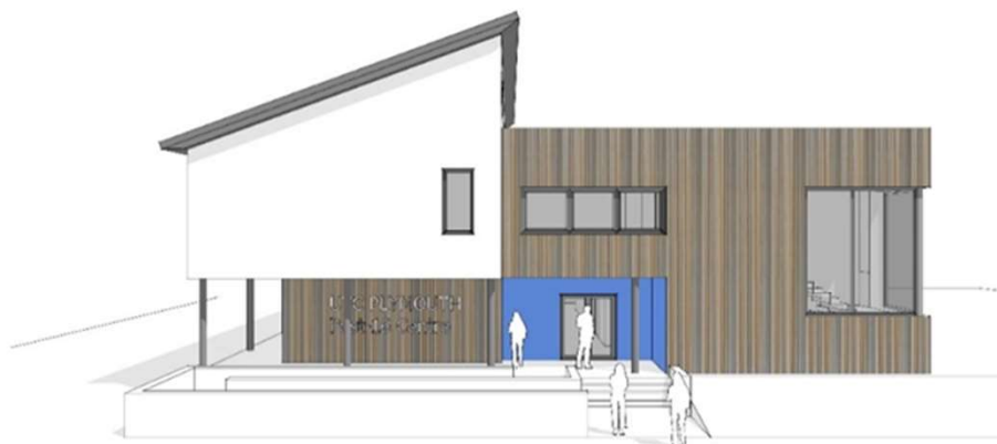
Proposed South Elevation